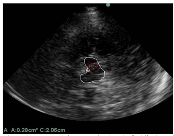
Figure 1. Transcranial sonography (TCS) of midbrain and maximal area of substantia nigra (SN) hyperechogenicity The midbrain outline is colored in white and the SN area in red.

The mean age of GBA mutation carriers was 35.57 \pm 6.92 years, and the control was 34.92 \pm 10.14 years.