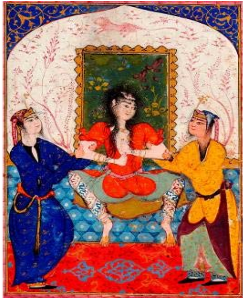
Figure 1. This miniature, entitled "Zulaykha is mad with longing after having seen Yusuf in a dream for the second time", is attributed to Qazvin (Iran, 1581) and illustrates Jami's famous poem "Yusuf and Zulaykha" from 1483. In the left upper corner, an intimate scene of a loving couple symbolizes the union with her beloved Yusuf which the princess longs for so much (Left panel). The magnification shows Zulaykha in despair and being restraint physically by two of her servants (Right panel). The painting is on display at the David Collection, Copenhagen, Denmark (106b/2006; reprinted with permission;).

However, the king has his daughter shackled with a golden chain (a glimpse of which can be seen over Zulaykha's henna-stained feet), and she is kept in this state for an entire year. Although Zulaykha slowly recovers, her life is ruined by unreturned love, and she ends up old and alone.